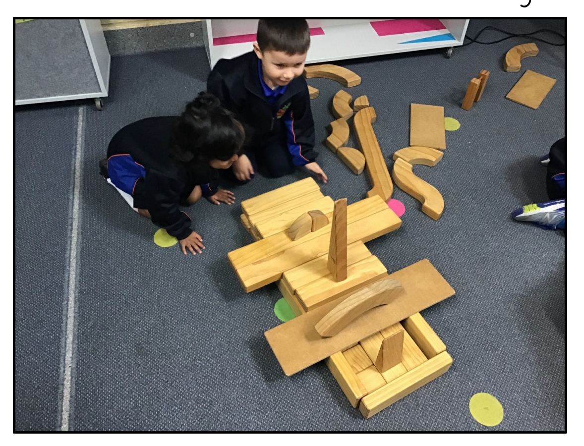
I will tell them about all the fun things I did at Kindy that day.

My family, or after school care, will pick me up at the end of the school day.