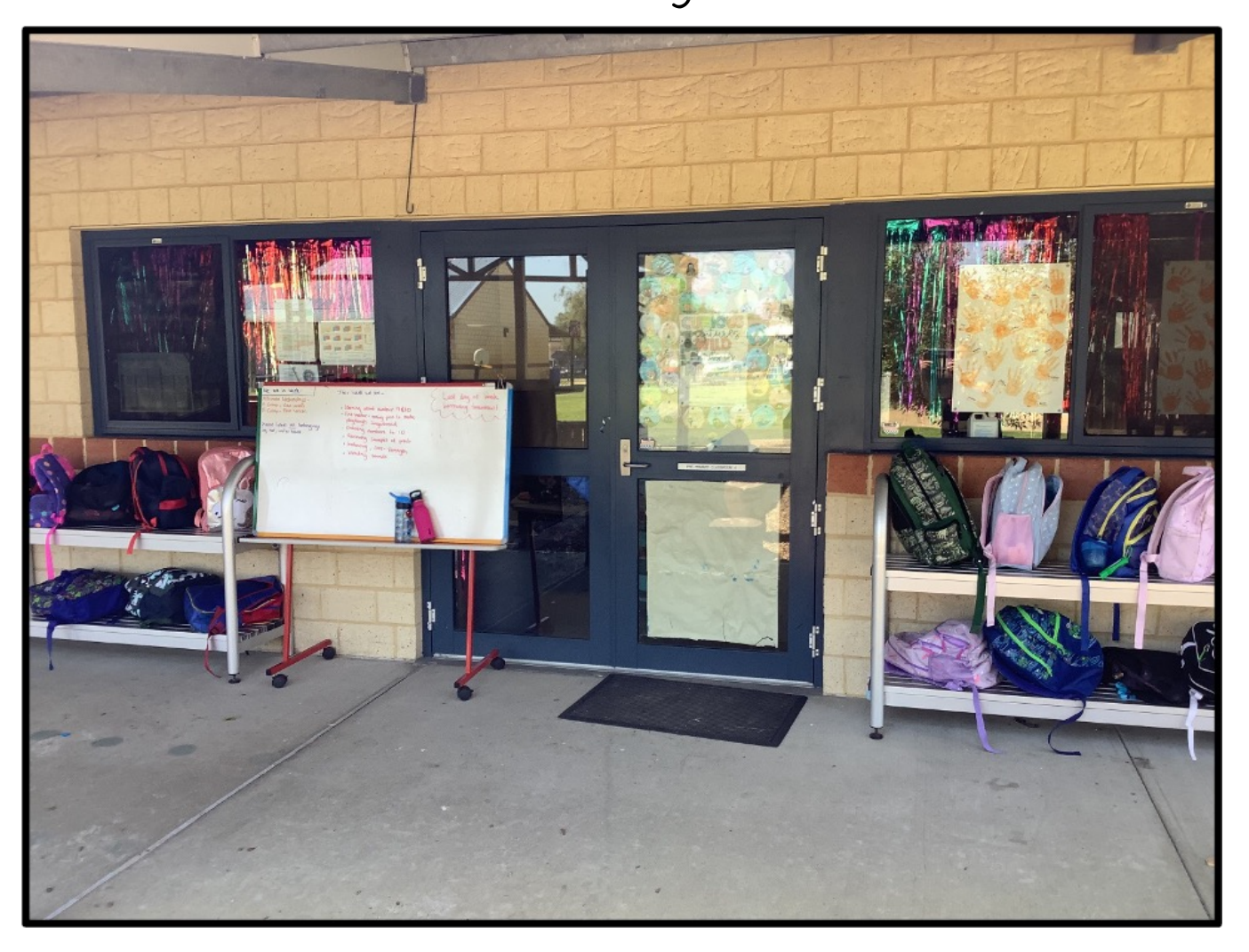
It is Room 2B