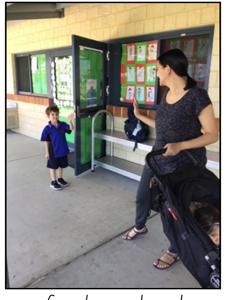
I will give my family a big hug, say "see you later" and wave goodbye! My family will say "bye" and leave.