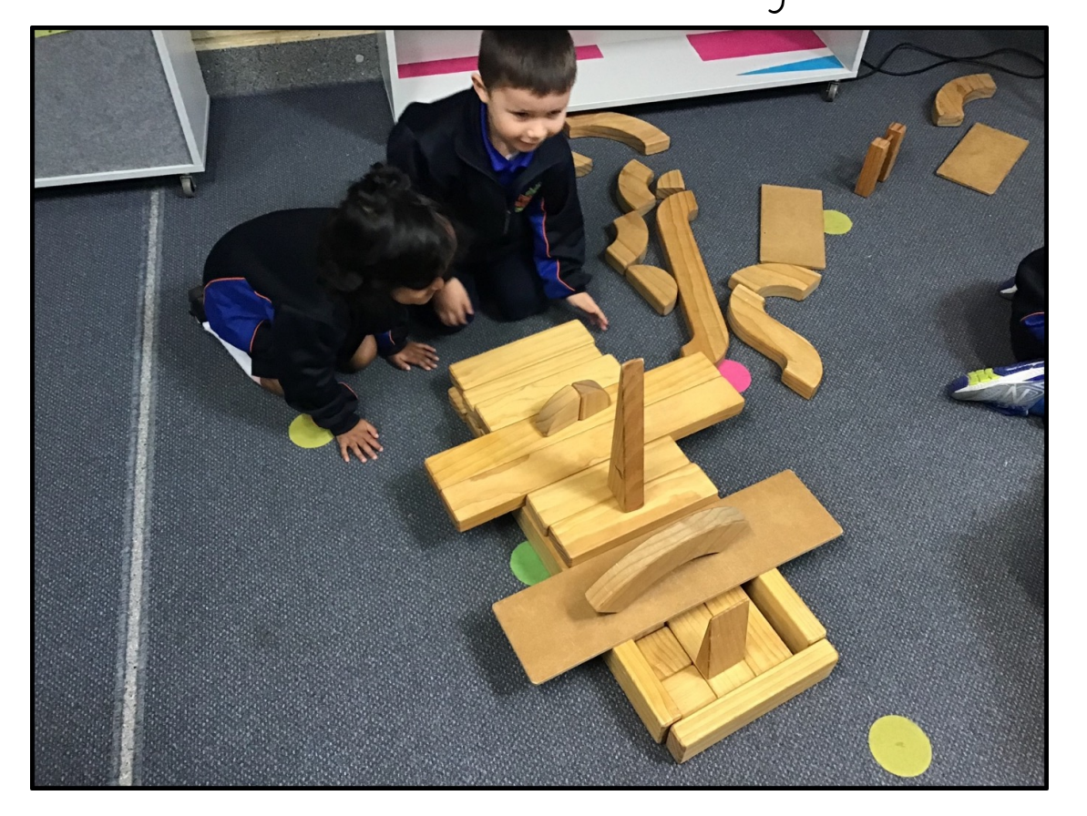
I will tell them about all the fun things I did at Kindy that day.

My family or after school care will pick me up at the end of the school day.