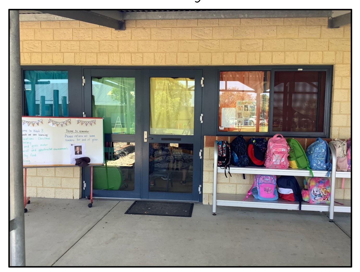
It is Room 1B