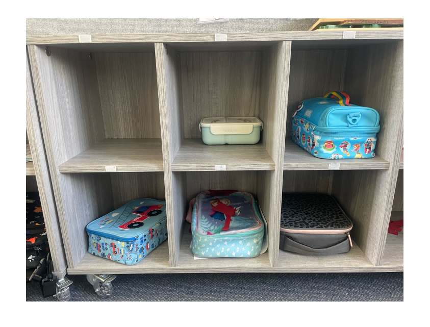
I will put my fruit or vegetable in the fruit tub for Crunch and Sip.

I will put my recess and lunch in my pigeonhole.