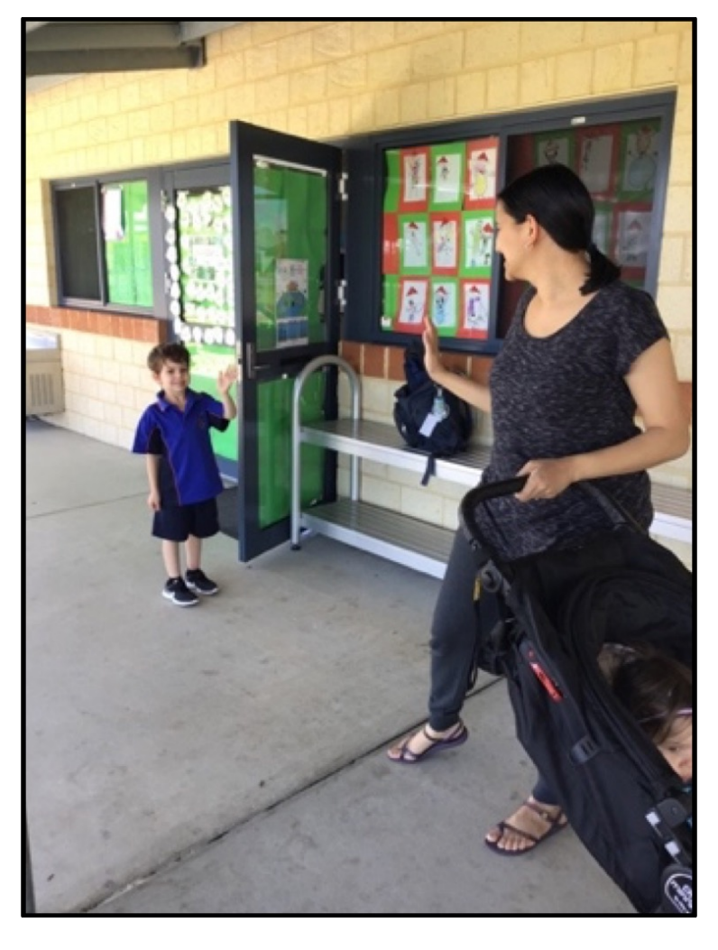
I will give my family a big hug, say "see you later" and wave goodbye! My family will say "bye" and leave.