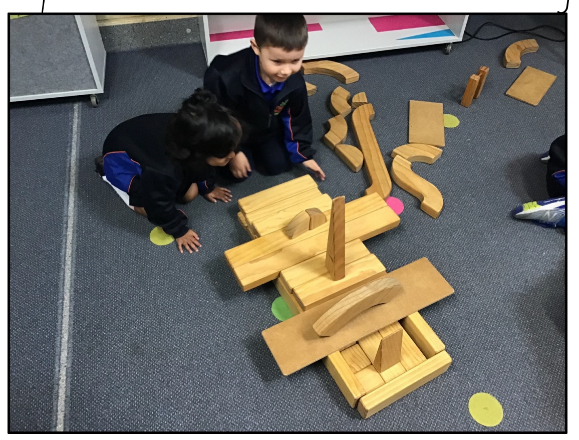
I will tell them about all the fun things I did at Kindy that day.

My family, or after school care, will pick me up at the end of the school day.